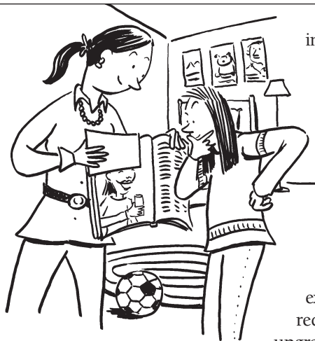
image the company is portraying (example: "Good-looking and popular people drink our soda").

Activity: Cover up brand names in ads. See if your middle grader can guess what they're selling. She may be surprised by how much they focus on attractive models or funny situations rather than on the products. Ask her what